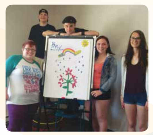
Co-workers showing off their teamwork.

There is also time for self-exploration to identify current strengths and personal reflection about challenges and successes. As well, participants receive certifications in: Smart Serve, First Aid, AODA & WHMIS, Safe Food Handling, Health & Safety, and Fire Safety.